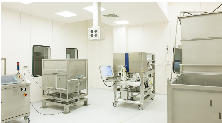
Colorex EC niagara